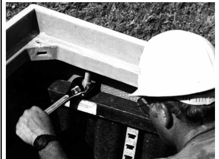
ADJUST TO GRADE OPTION.