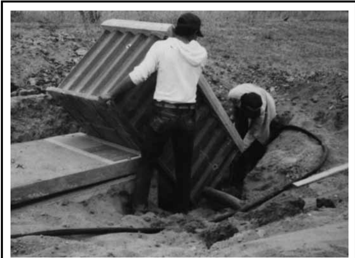
TWO MEN EASILY HANDLE A SERVICE BOX.