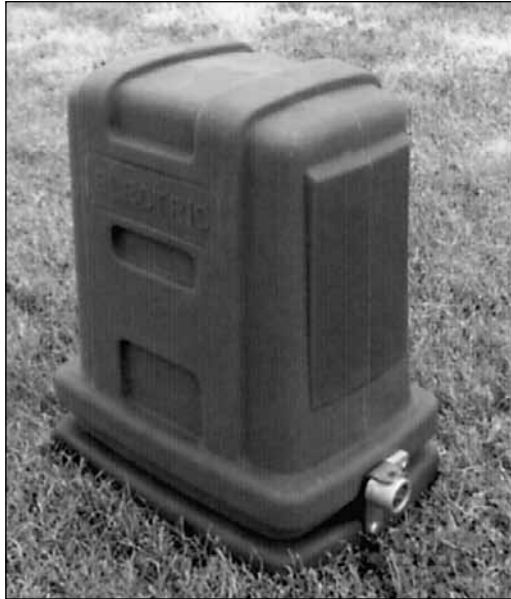
Figure 1. Munsell Green unit installed

Designers and Manufacturers of Rustguard Enclosures, Primary Sectionalizing Cabinets, Secondary Pedestals and Pole Line Hardware