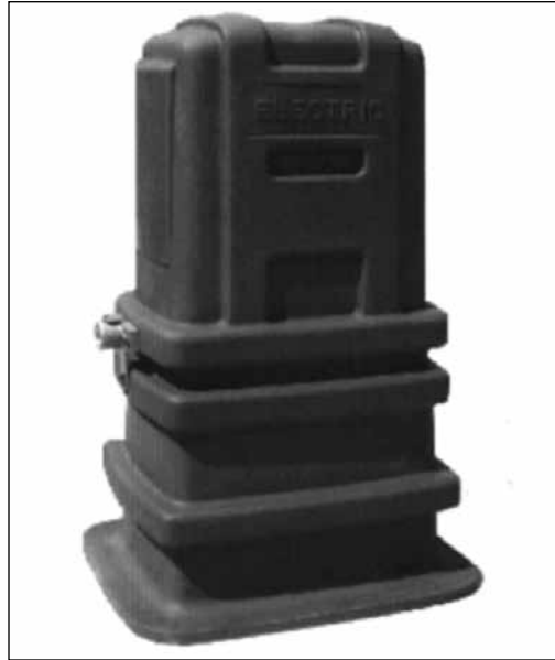
Figure 2. Munsell Green unit uninstalled